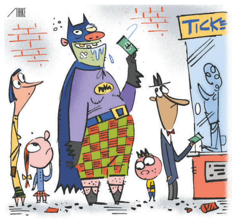
BOB STAAKE FOR THE WASHINGTON POST

in which we presented 100 "tile sets" of seven letters each from the ScrabbleGrams feature that appears daily in The Post, and asked you to come up with your own terms (all the tile sets were designed to generate only six-letter words). We got so many neologisms for this contest that we're running them over two weeks. (See the first group in the June 9 Sunday Style section or online at bit.ly/invite1025.)